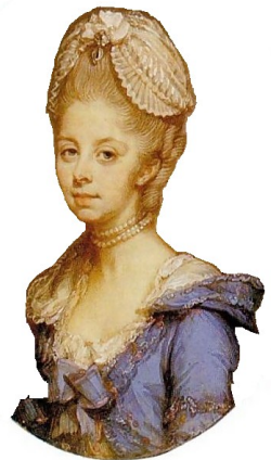
Princess Sophie Charlotte of Mecklenburg-Strelitz for whom our city and county are named. She married George III and became Queen Charlotte.